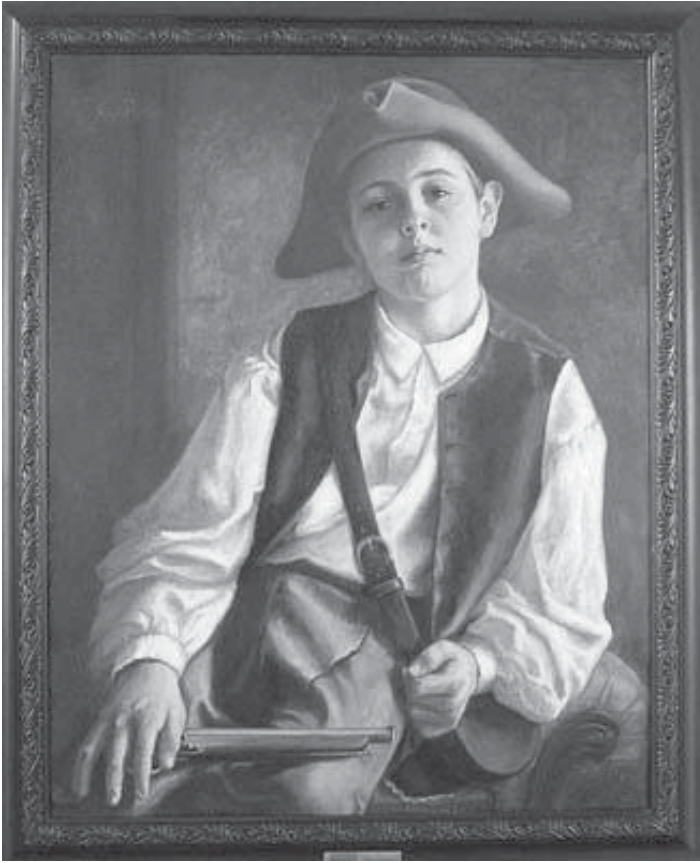
THE 229 TH ANNIVERSARY OF THE BATTLE OF ORISKANY