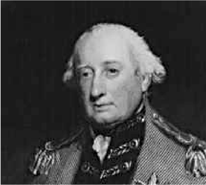
Lord Charles Cornwallis

“And The Story Continues” Continued from Page 4