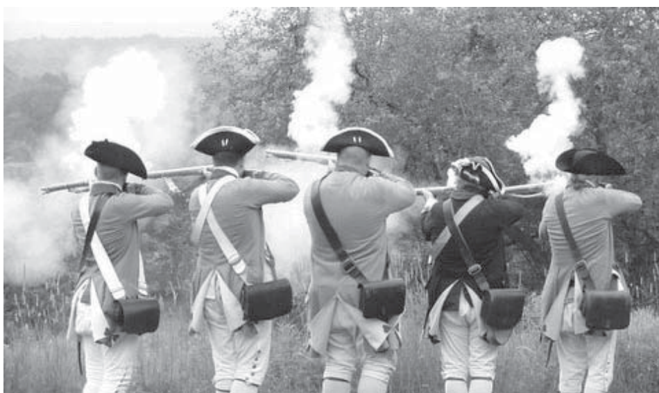
Volunteers & Battlefield Staff fire muskets to mark opening of the ceremony