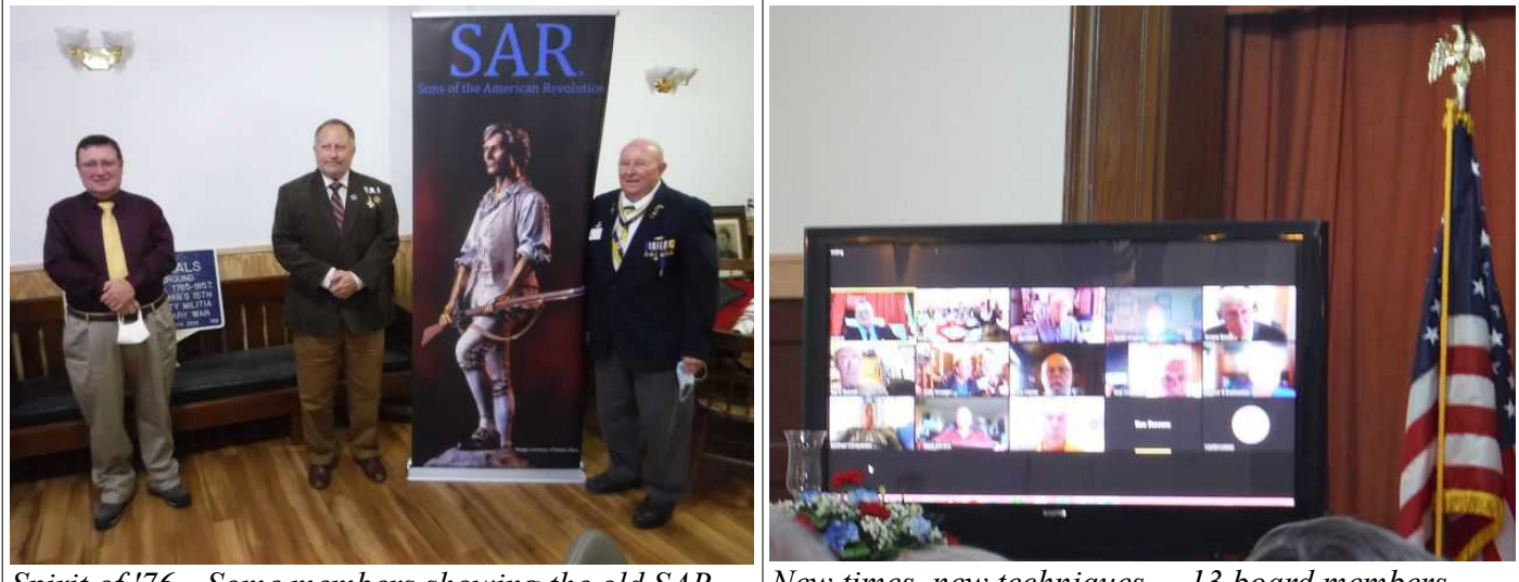
Spirit of '76 --Some members showing the old SAR Patriot spirit by attending in person.