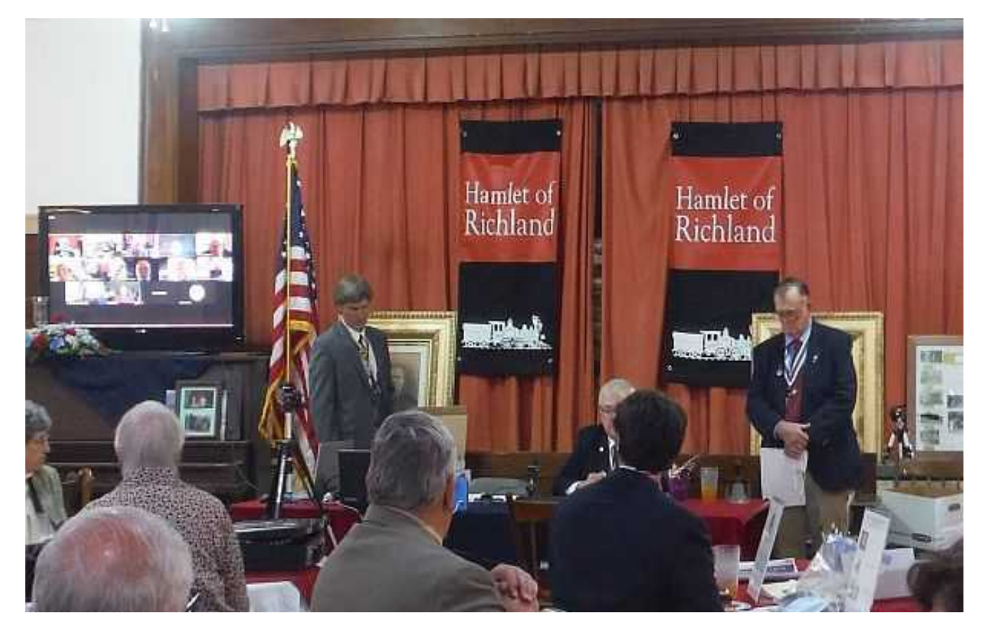
ESS-SAR Board Meeting – The first hybrid meeting with actual and virtual attendees gets under way.

The Fall meeting of the Empire State Society SAR Board of Managers meeting was held on September 19, 2020, in Richmand, NY. It was hosted by the Syracuse Chapter SAR. It was the first meeting of its kind for ESS-SAR – a hybrid one with both actual and virtual attendance. The new format was necessitated by the continuing problems of the COVID-19 pandemic, and was permitted by an edict of the NYS Governor.