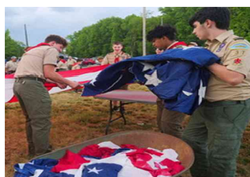
Scouts preparing flags for disposal. Flag burning in progress.