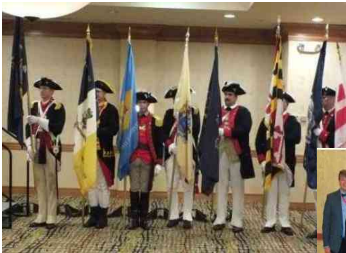
Opening Ceremony 2016

Photos below are from the Atlantic Middle States Convention held in Albany, in 2016.