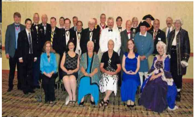
Formal Dinner 2016