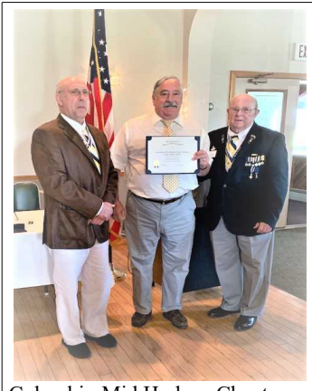
Columbia-Mid Hudson Chapter, Flags Across America.