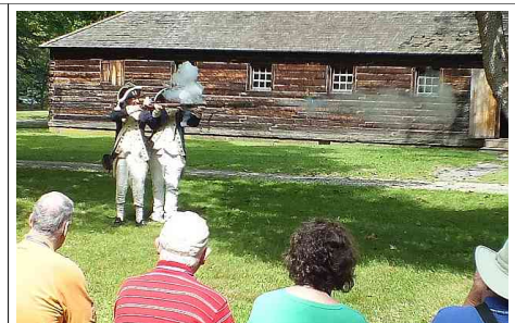
Weapons Firing at New Windsor Cantonment