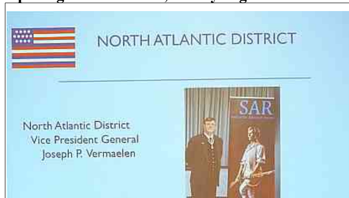
Opening of Conference