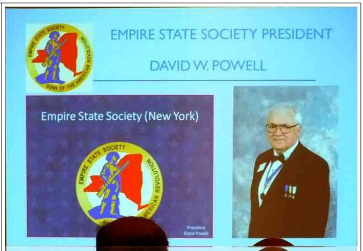
Empire State Report