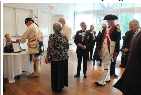
Opening Social Time