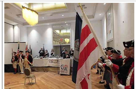
Closing of Conference