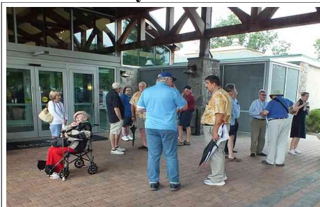
Awaiting Bus Tours