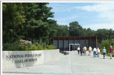
National Purple Heart Hall of Honor