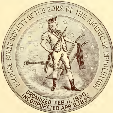
SEAL OF THE EMPIRE STATE SOCIETY, S. A. R.