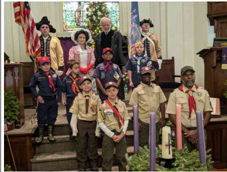
Scouts at Wreaths Across America