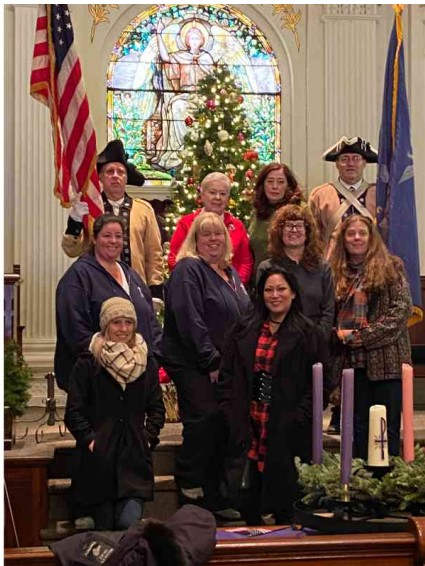
DAR members at Wreaths Across America ceremony at the Reform Church of Staten Island.