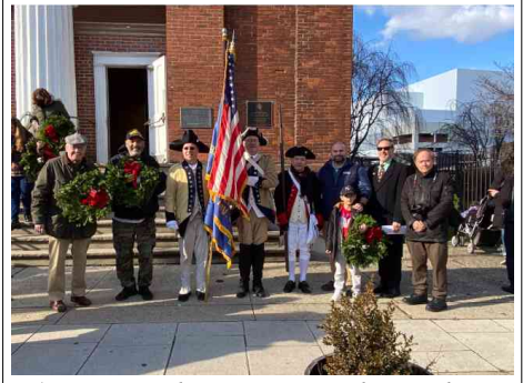
1 st New York Continental members