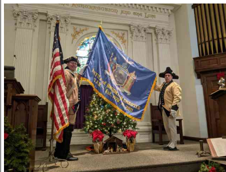
Battle of Brooklyn flag