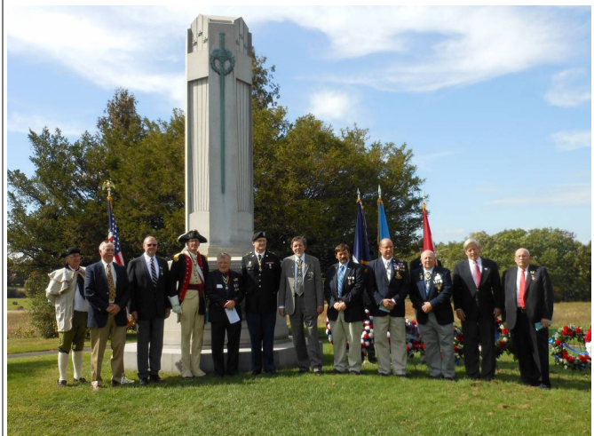
Saratoga Battlefield Commemoration -- Saratoga Battle Chapter members gather at the Revolutionary War monument in the Saratoga Battlefield National Park following their wreath laying ceremony

On September 20, 2014 the chapter joined with members of the Walloomsac Battle Chapter in the annual commemoration of the Battles of Saratoga, with a wreath laying at the Saratoga Battlefield National Park in Schuylerville NY