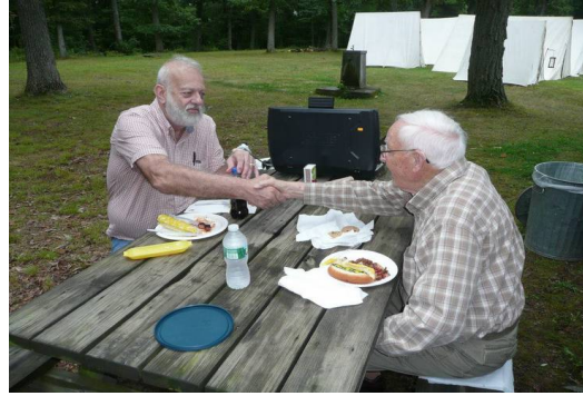
Chapter Annual Picnic

In addition to the picnic and fellowship, attendees could visit and purchase wares and accoutrements from various sutlers, visit the Patriot, Indian, Tory and British encampments, and participate in a "woods walk" battle re-enactment, where you took on the role of a Tory or Patriot refugee, escorted by the appropriate army