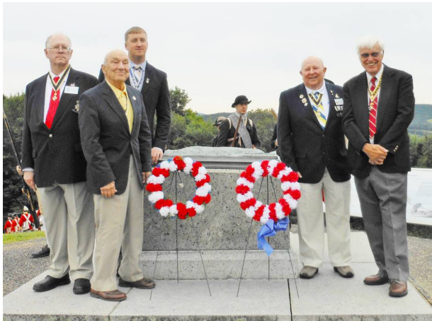
Battle of Bennington Remembrance --

Members of the chapter together with the Saranac Chapter DAR traveled to Fort Chambly in Quebec for the annual commemoration of the sacrifices made by withdrawing American forces during the Revolution.