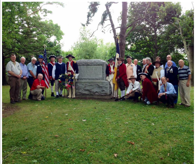
Unknown Soldiers Monument -- SARs gathered at the Ft. Niagara Cemetery Monument commemorating the unknown Soldiers buried in the cemetery.