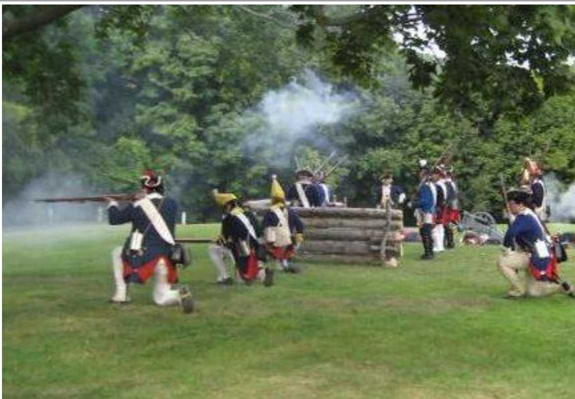
British troops including hired German Brunswickers, those with the pointed helmets, fire on the Americans as the battle begins.