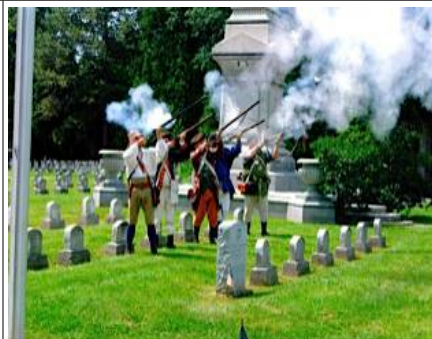
Mt. Hope Cemetery Tour