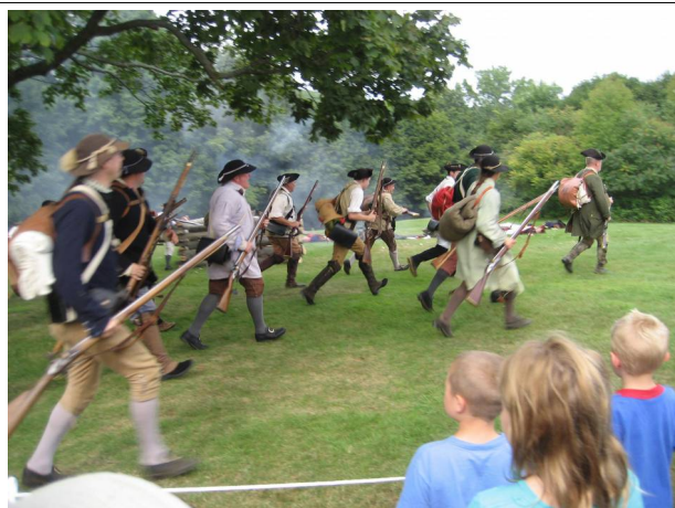
Loyalists who were present that day and fighting with the British retreat