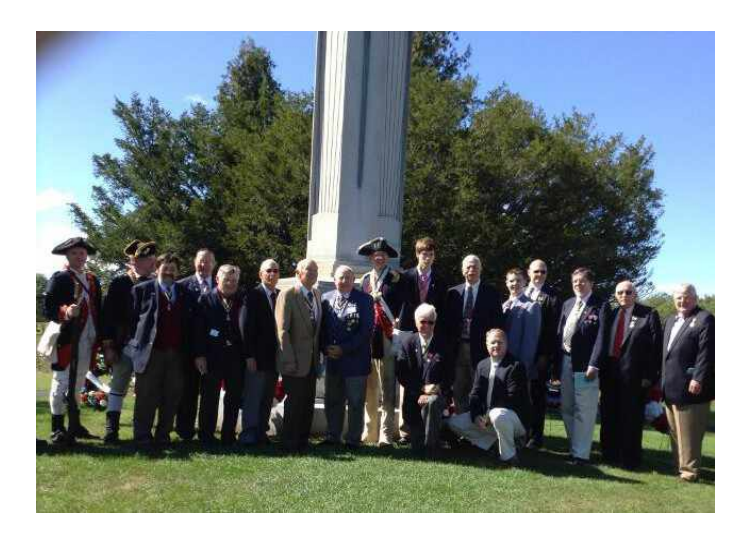
Annual commemoration of the Battles of Saratoga.

• Walloomsac Battle Chapter -- Members of the Walloomsac Chapter the joined with those of the Saratoga Battle Chapter in the annual commemoration of the Battles of Saratoga, with a wreath laying at the Saratoga Battlefield National Park in Schuylerville NY on September 20, 2015.