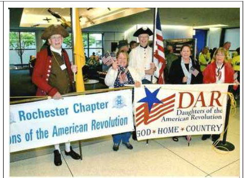
Honoring our Veterans at Rochester Honor Flights