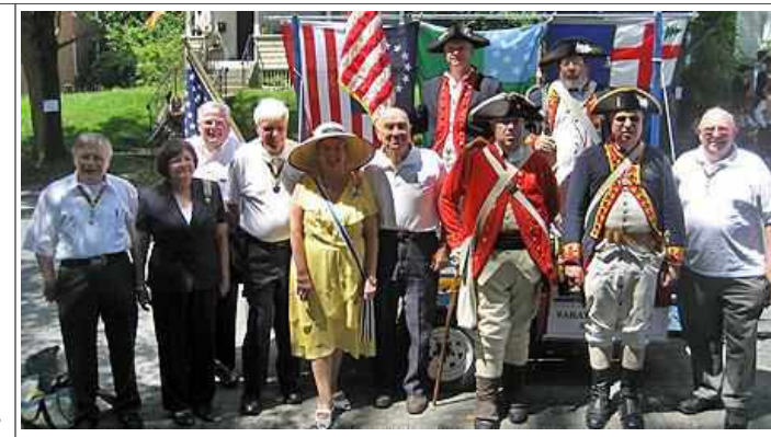
Members of the Saratoga Battle Chapter participating in the Annual Turning Point Parade.