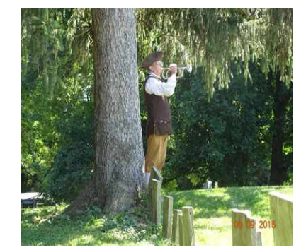
Tombstone Dedication at Miller Barker Cemetery

• Rochester Chapter -- Photos of some recent Chapter activities