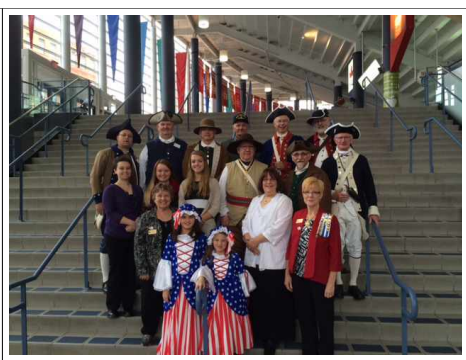
Veteran's Day Ceremony, November 11, 2015