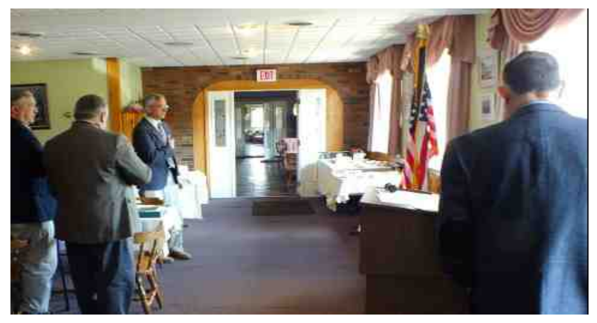
Members salutes the flag at the opening of the meeting

The Columbia Mid-Hudson Chapter hosted the final meeting of the Board of Managers for 2019, which was held on Saturday, November 2, in Coxsackie, NY.