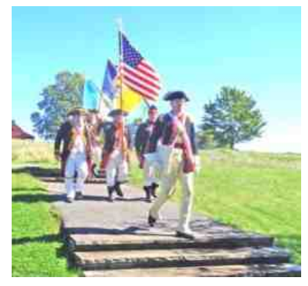
Saratoga Battle Chapter Color Guard at Saratoga National Historical Park Wreath-Laying.

Parade organized by the Lower Manhattan Historical Association.