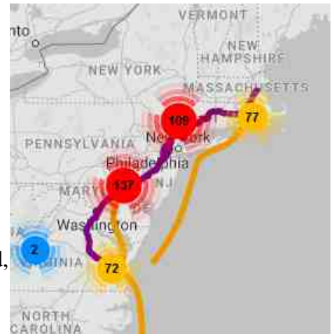
Route to Victory

This route to victory, runs from Massachusetts, through Rhode Island, Connecticut, New York, New Jersey, Pennsylvania, Delaware, Maryland, Virginia, and the District of Columbia. With the French Navy in support, the allied armies moved hundreds of miles to become the largest troop movement of the American Revolution. The effort and cooperation between the two sides led to a victory at Yorktown and secured American independence