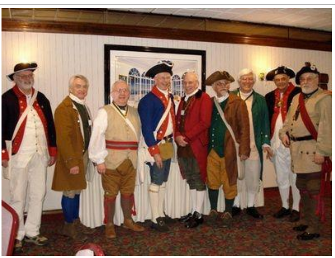
Compatriots at the Chapter's Washington Day Luncheon.