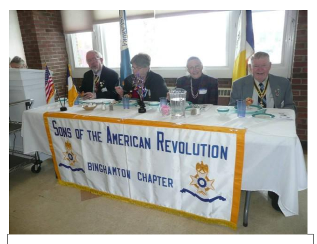
Binghamton Chapter, & Tuscarora Chapter, NSDAR at their Annual Joint Winter Lunch Meeting.