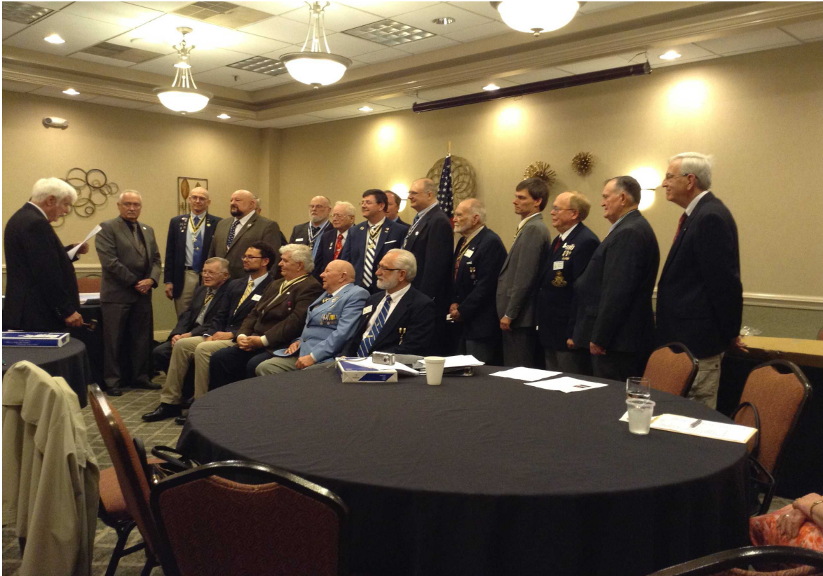
Installation of Officers during the May 2017 Annual Meeting.

The following photo is from the 2017 Annual Meeting.