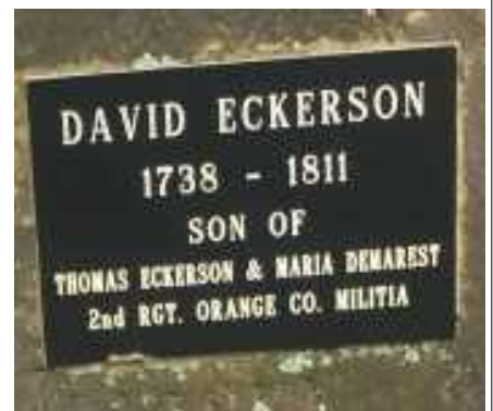
Revolutionary War Soldier remembered.