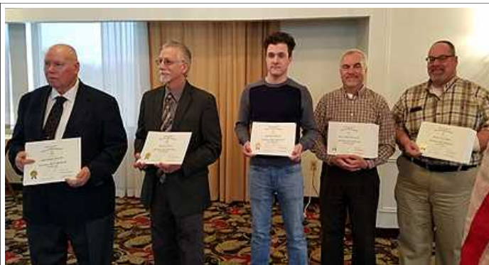
Induction of new members.