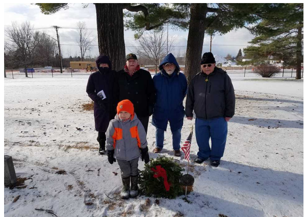
Honoring the unknown Revolutionary War Soldier.