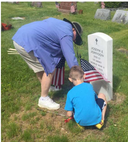
Honoring Veterans graves with flags.