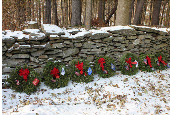
Chapter's first Wreath Across America wreath laying at the Stoutenburg Family Cemetery, in Hyde Park, NY.