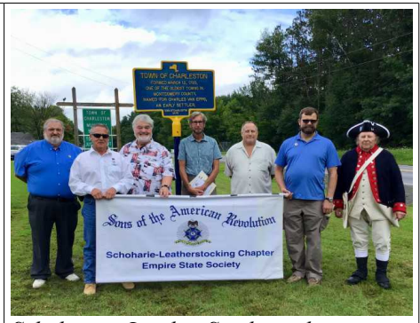
Schoharie - Leather Stocking chapter at Charleston Dedication Ceremony.