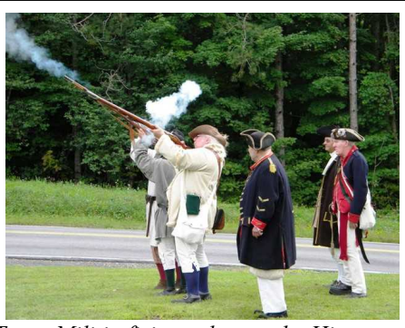
Tryon Militia firing salute at the Historical Marker dedication .