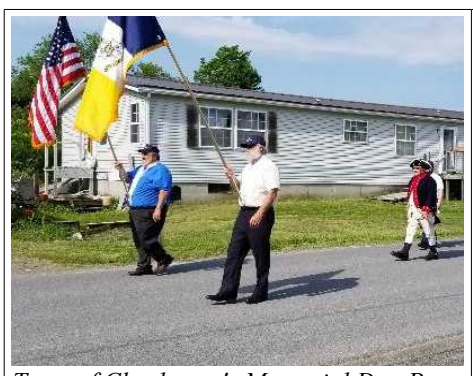
Town of Charleston's Memorial Day Parade.