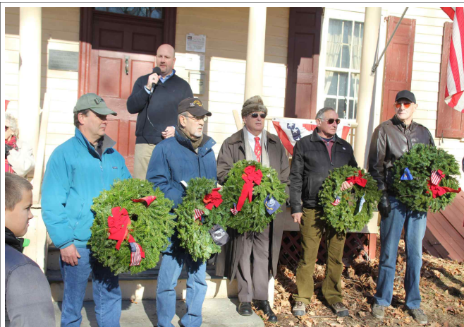
Van Wyck Homestead