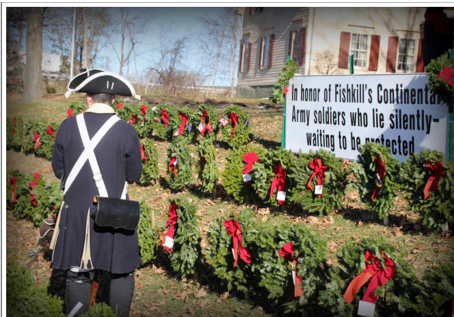
Fishkill Supply Depot