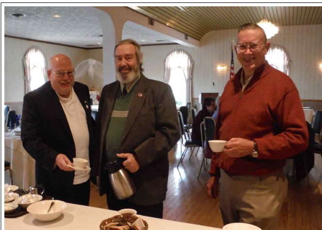
Attendees enjoying coffee before the meeting.

The Columbia-Mid Hudson Valley Chapter hosted the Fall Empire State Society Board of Managers Meeting on Saturday, November 1, 2014 at the Pegasus Restaurant in Coxsackie, NY.