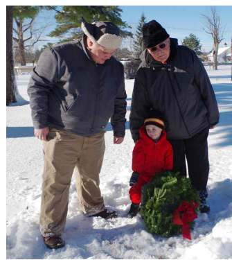
Remembering Unknown Soldiers