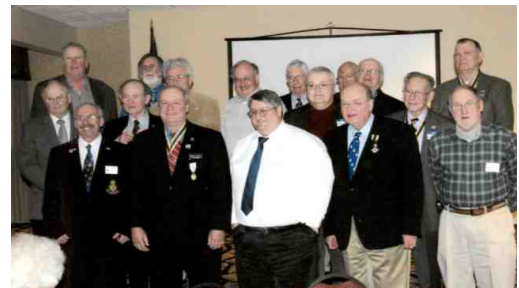
Compatriots at the 112th annual Heritage Luncheon.