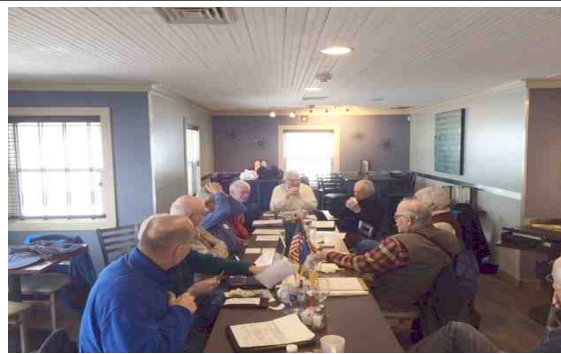
Board of Managers Meeting,