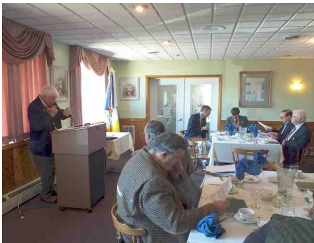
Getting down to business.