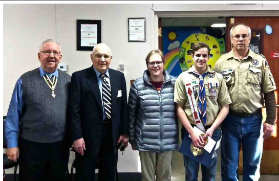
Eagle Scout Essay Contest Award Presentation